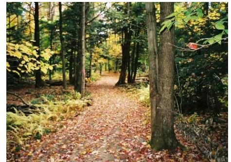
At the entrance to the Mission

tion... each of these providing a way to 'draw nigh unto God,' as it says in James 4:8. A traveler down any one of these paths might find the steps with the Beati-